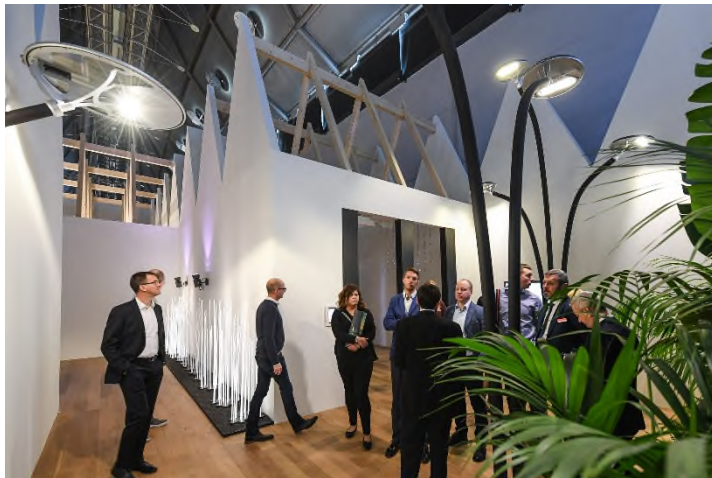
Guided tours at Light + Building: discover selected innovations and learn more about the top themes.

The third top theme "Light & Design" focuses on light. Both the quality and the design of lighting play an important role in room and building planning. The topic of sustainability is evident in the use of natural materials and colours as well as the recycling of resources. In addition, light as part of the building architecture has an influence on well-being, performance and safety. In the UVC range, the disinfection of air and surfaces is possible.