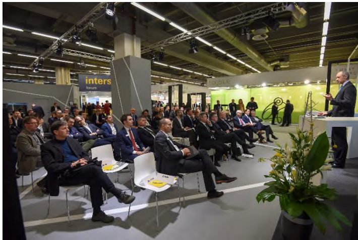
The Intersec Forum: from 14 to 18 March 2022, the central information interface of Intersec Building, the product area for connected security technology at Light + Building.

Live and with a secure event concept, the fifth Intersec Forum, conference for connected security technology, will take place in 2022: It starts on the second day of Light + Building and accompanies the leading international trade fair for lighting and building technology in its Intersec Building section - with conference knowledge and expert exchanges on all aspects of connected technologies for the security of and in buildings.